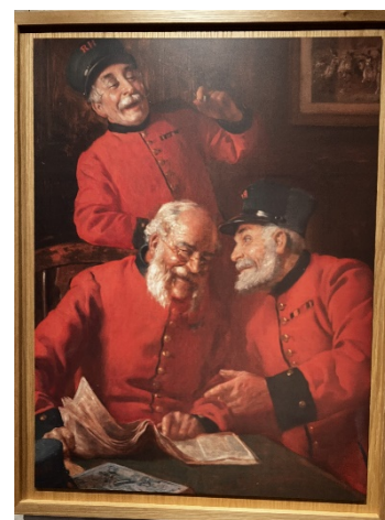
One of the lovely works of art at the Museum

Then back on the coach again to see some of the Christmas Lights.