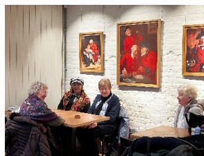
Cup of tea time