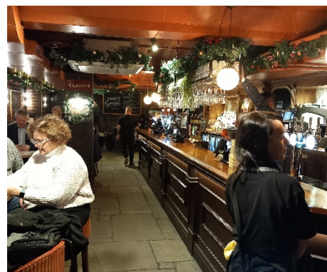
The Punch and Judy pub